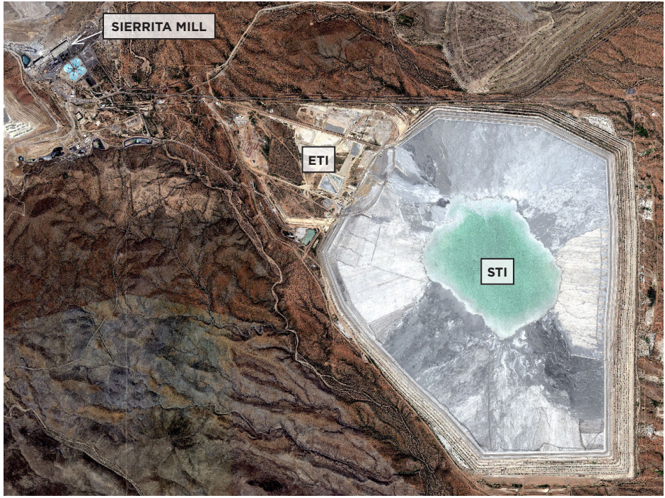
Figure 3. Sierrita Layout (June 2024).