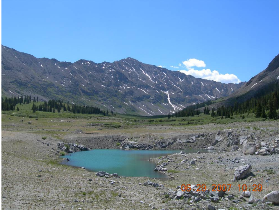
Figure 5. Lake prior to restoration.