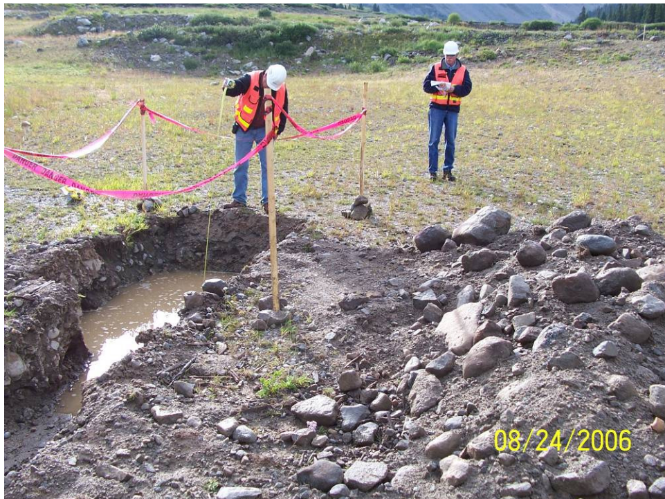
Figure 8. Test Pit 8 filled with rain water.