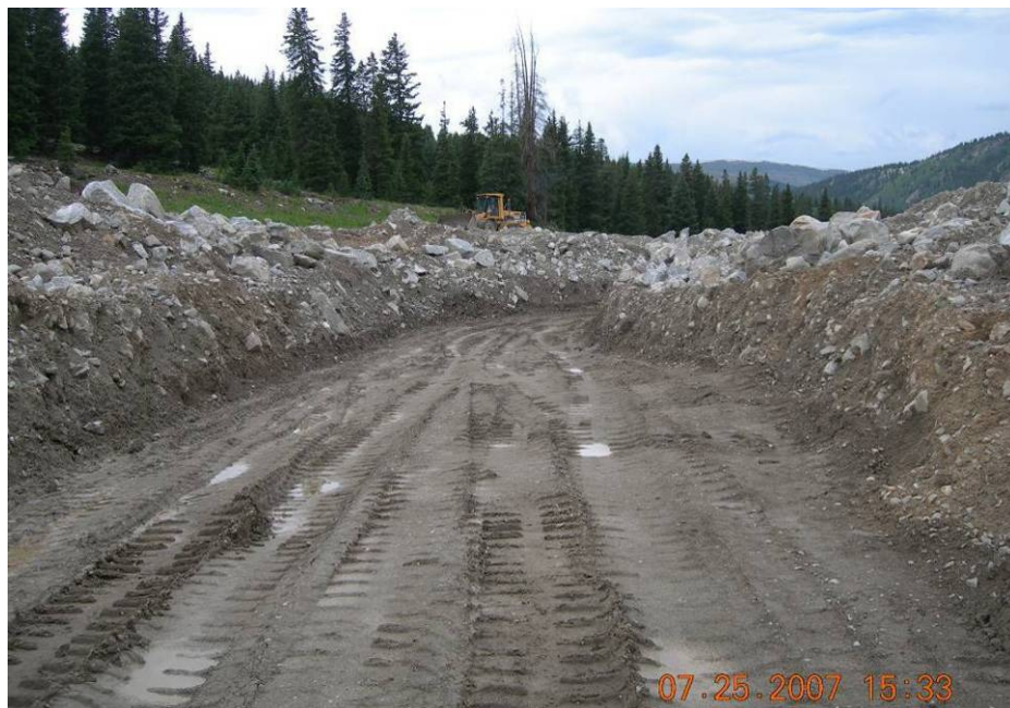
Figure 16. Compacted 2-inch minus material in the Downstream channel.

Data from the preconstruction survey of the reference reaches had been used to determine riffle-pool and step-pool spacing and locations along the meandering alignment of the river. The first riffle-pool sequence was built approximately 150 feet above the drop structure. Riffle-pool and step-pool location information was transferred to the center line shown in the post construction terrain model to guide the placement of rock as channel construction proceeded.