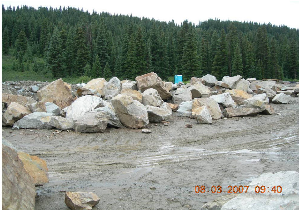
Figure 15. Limestone boulders imported from the Climax quarry.