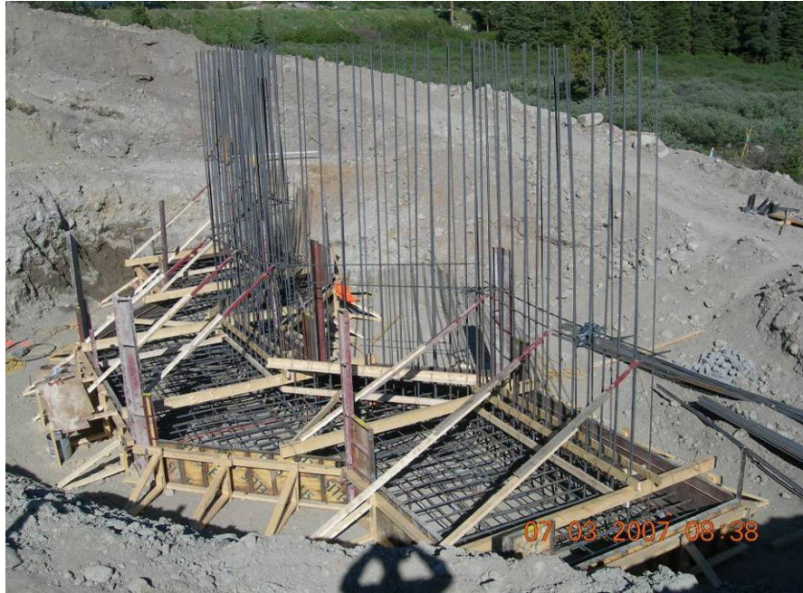
Figure 28. Rebar skeleton of drop structure retaining wall.