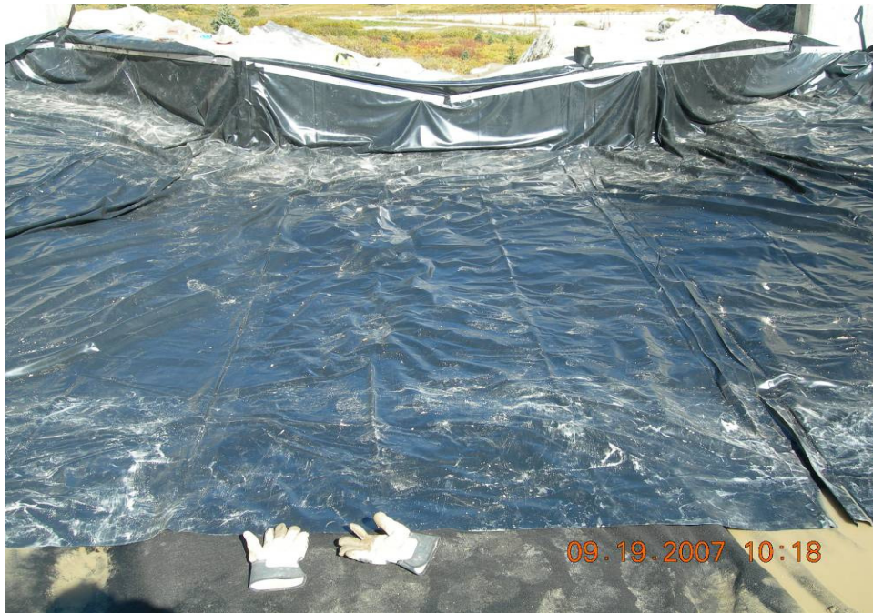
Figure 31. Geomembrane bolted to the retaining wall of the drop structure.