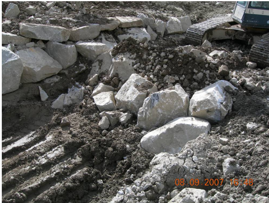
Figure 20. Riffle structure during construction.