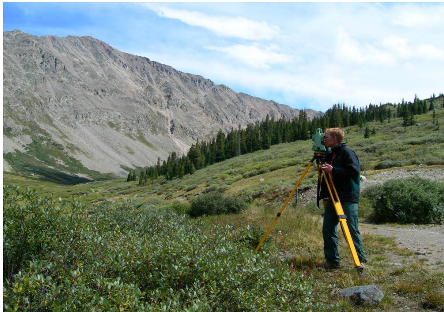
Figure 9. Surveying fluvial geomorphic characteristics of reference reaches.

* Pools in riffle-pool sequences were typically wider than the preceding riffle.