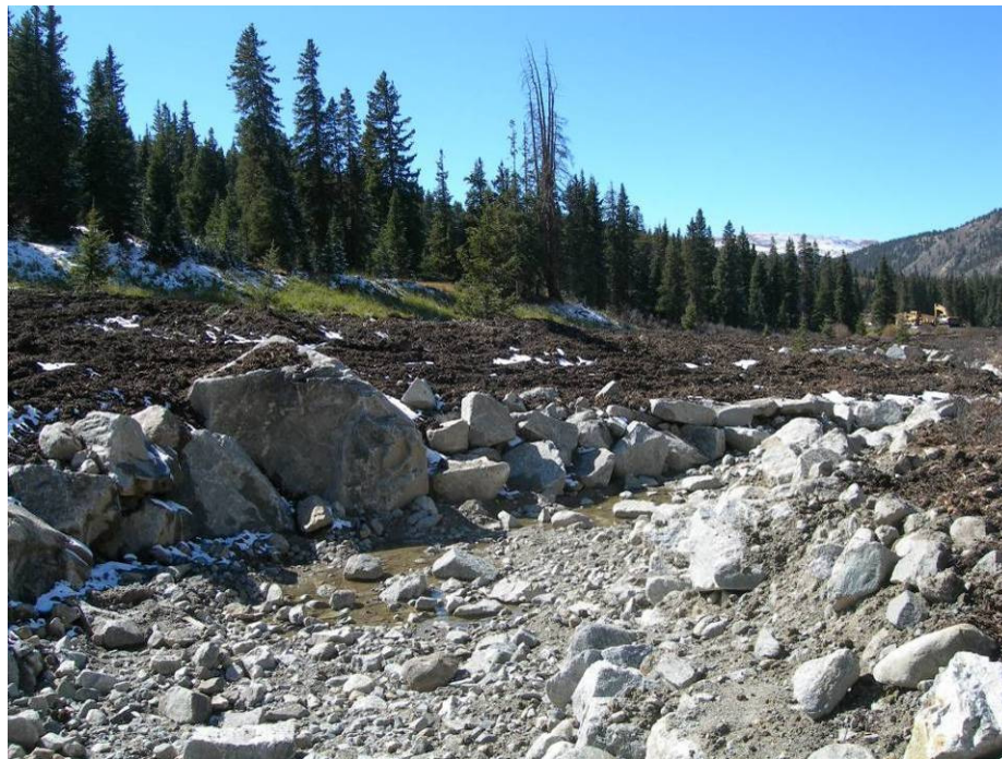
Figure 17. Keystone boulder and armoring at the outside of a meander.

Natural fluvial geomorphic processes create dynamically stable streams as a result of flow dynamics within meandering channel geometry. The sinuous alignment of the restored river was designed to encourage the development of point bars through these processes. Lower side slopes on the inside of meanders allow the river to access its floodplain, expanding and slowing flow and causing the deposition of sediments. On the opposite bank, at the outside of meanders, stockpiled material was used to provide armoring for steeper side slopes that are not overtopped during 100-year design storm. Boulder walls at these steep banks were configured specifically to prevent bank scour. Keystone boulders (Figure 17) were placed above footer rocks keyed into the toe trench and buried in the substrate. Additional boulders were set contiguous to the keystones for a distance of approximately 50 to 100 feet in both directions. These boulders were all placed in a manner to protect adjacent rocks from scour by tucking the upstream edge of the downstream boulder behind the next successive upstream boulder. This configuration deflects water away from the gaps between boulders which could be susceptible to infiltration or scour from flowing water. Once boulder placement was complete, areas behind the constructed banks were backfilled and bucket packed and smaller rip rap was installed along the length of the channel (Figure 18). Similar rock linings were observed in the reference reaches (Figure 19).