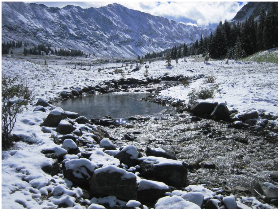
Figure 21. Completed riffle structure.