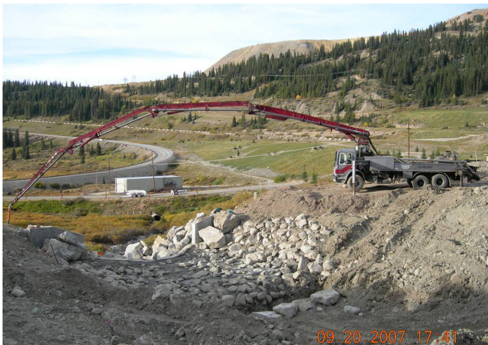
Figure 32. Concrete pump truck grouting drop structure.