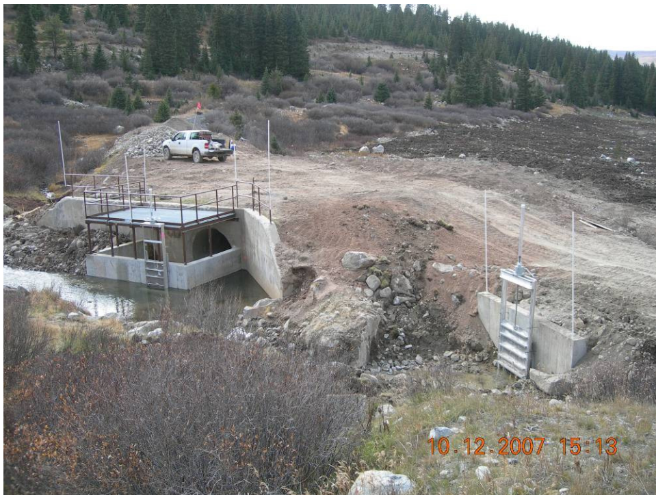
Figure 4. Finished pipe and channel inlet structures.