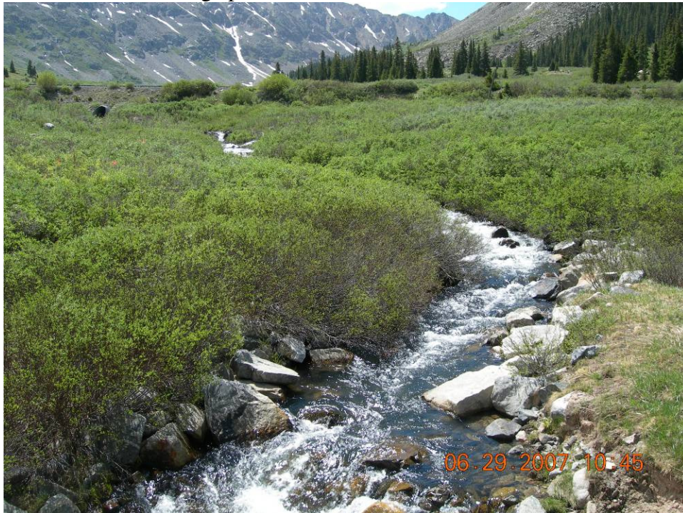
Figure 19. Reference reach incised channel geometry and rock armoring.