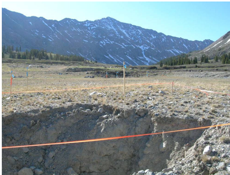
Figure 11. Construction staking in the upstream channel.

Construction staking (Figure 11) was performed using high resolution Leica survey grade GPS equipment. Transects were projected across the post-construction digital terrain model, loaded into the Leica GPS equipment and field located. Cut and fill depths were assigned to construction stakes based on the elevation of the existing ground surface relative to the proposed ground surface of the terrain model.