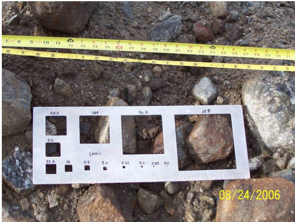
Figure 7. Material encountered in a test pit excavation.