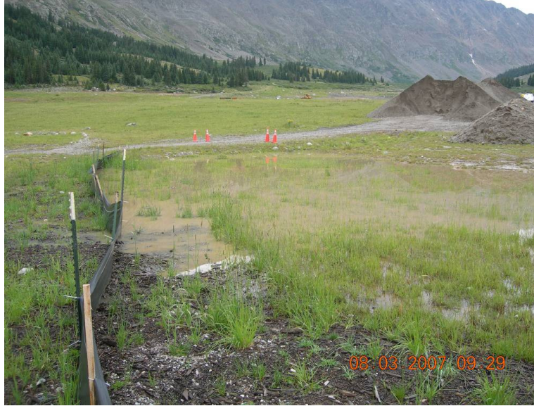
Figure 10. Silt fence along the downstream perimeter of the project site.