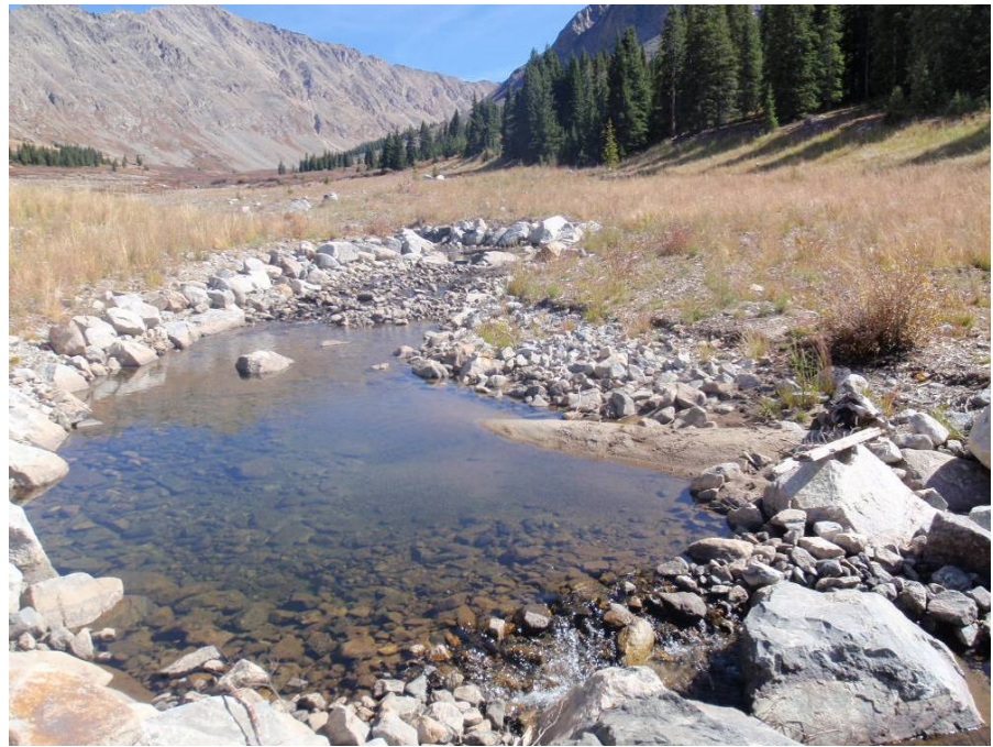
Figure 25. Deposition at an inside meander.