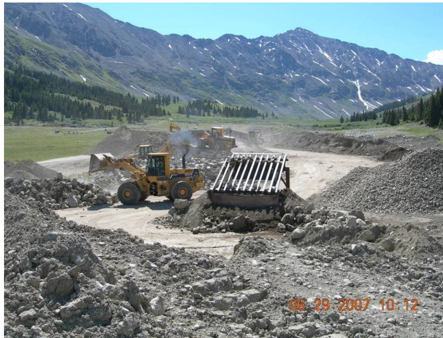
Figure 13. Grizzly operation sorting boulders and finer materials.

The screening plant produced four rock sizes including 2-inch minus, 2 to 5-inch cobble, 5 to 8-inch rock and 8 to 12-inch riprap. All sorted materials were stockpiled for later use in the construction of the channel seal, bed forms, banks, riprap armoring and the drop structure. Additional boulders were imported from an on-site limestone rock quarry located on the northwest side of the Climax Mine (Figure 15). Approximately 300 boulders measuring greater than four feet across their median axis were imported to the Storke yard for use in the stilling basin and in the face of the drop structure.