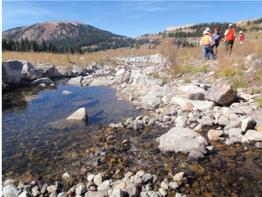
Figure 26. Deposition on the inside meander at a pool.