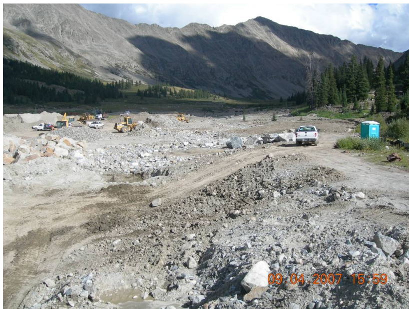
Figure 12. Excavating materials from the downstream channel.

Over-excavation ranging from 1 to 3 feet was required in the bed and banks to allow for embedding riprap and other rock required for bank stabilization and/or the development of riffle-pool and step-pool sequences, and to allow for the placement of 1 to 3 feet of seal material. In addition, a toe trench was excavated to accommodate the placement of toe rock and to allow pool weirs to be adequately keyed. The Komatsu 300 was used to over-excavate the new channel.