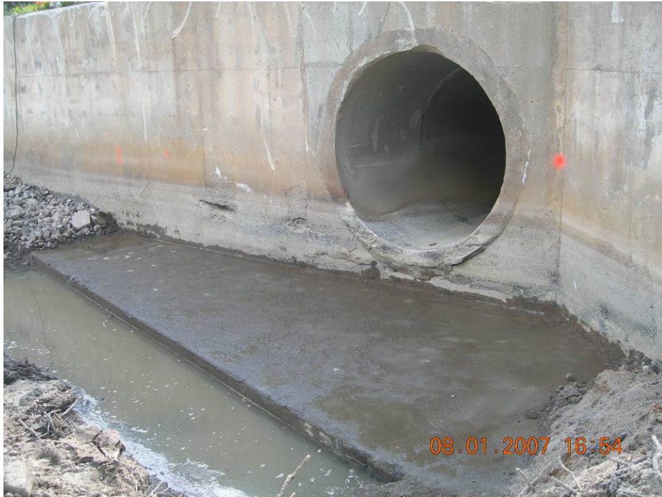
Figure 3. Uncontrolled entrance to the Storke Yard pipeline.