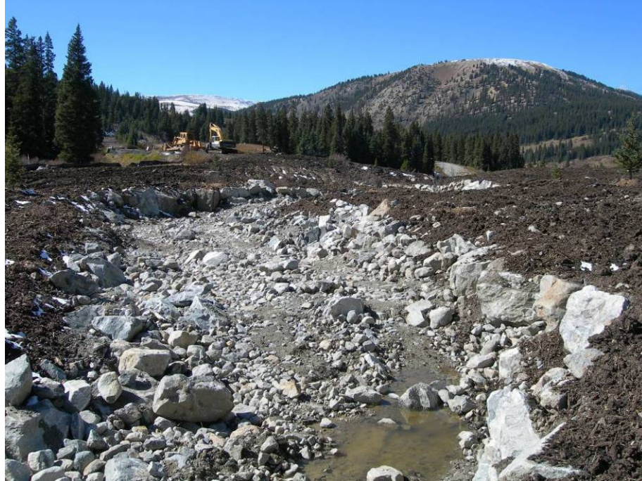
Figure 18. Incised channel will be overtopped by high flows at the inside meander to encourage point bar formation.