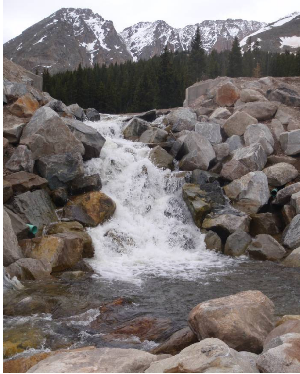
Figure 33. Completed waterfall feature.