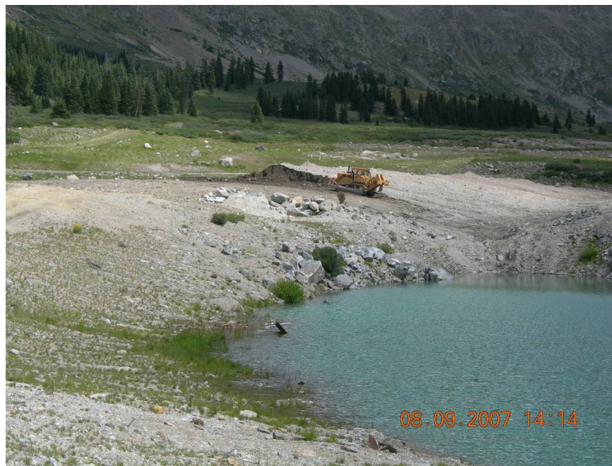
Figure 35. Pushing a materials stockpile into final topography.

for three seasons, with peak snowmelt flows typically occurring beneath heavy snowpack. Monitoring for ice jams during the peak snowmelt period is conducted using snowshoes to access the channel, and the channel is reassessed after snowmelt. The channel has maintained gross channel stability while responding to fluvial geomorphic forces by developing features observed in natural stream reaches. Areas of aggradation provide substrate diversity and will support further establishment of riparian vegetation and aquatic biota. The project has contributed to the understanding of high altitude stream and disturbed landform restoration through the integration of a wide range of innovative design technology and construction techniques. Information about the revegetation approach utilized for this high altitude site is provided separately in these proceedings in Bay et al. (2011)