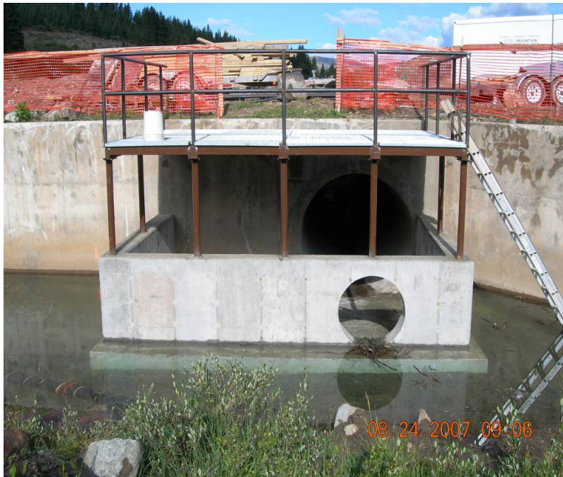
Figure 34. Inlet box with upper steel structure.