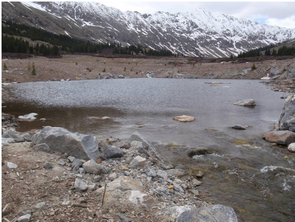
Figure 6. Lake after restoration.