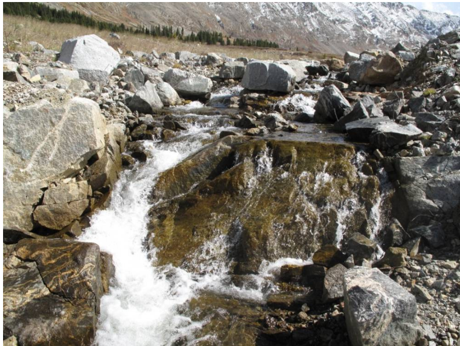
Figure 23. Bedrock outcrop incorporated into river bed and bank.