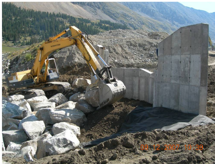
Figure 30. Placement of boulders over bedding materials and geotextile.

was constructed from the bottom up with two layers of 4- to 7-foot diameter boulders placed over a layer of geotextile and bedding material. Boulders were then placed up the face of the drop structure with the same overlapping method used for the river banks, eventually tying into the top of the cut-off wall (Figure 30). The inlet to the cut-off wall and drop structure was constructed with 2-foot diameter riprap placed over an impermeable 12 mil (.012-inch) thick vinyl geomembrane anchored to the wall (Figure 31). Once all boulders and rock had been placed, a concrete pump truck was used to grout the structure (Figure 32). Approximately 118 cubic yards of a seven sack concrete grout were used to fill the voids on the face of the structure and the stilling basin. An additional 18 cubic yards of grout were used to cement in the inlet and to pour a 4-foot deep cut-off wall. The completed drop structure provides visual interest from Highway 91 (Figure 33) and makes a discontinuity between aquatic biota in the river upstream and downstream of the feature.