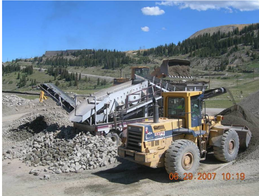
Figure 14. Clemro screening plant sorting 12-inch minus material.