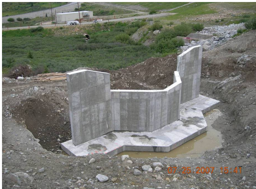
Figure 29. Finished retaining wall during 45-day cure period.

The downstream side of the waterfall required the over-excavation of an additional several thousand cubic yards of fill material. Boulder placement began once these materials had been removed and the stream channel above the drop structure had been completed. The stilling basin