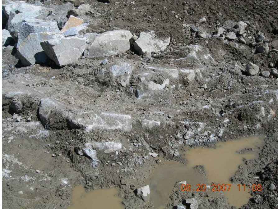
Figure 22. Bedrock outcrop encountered during construction.