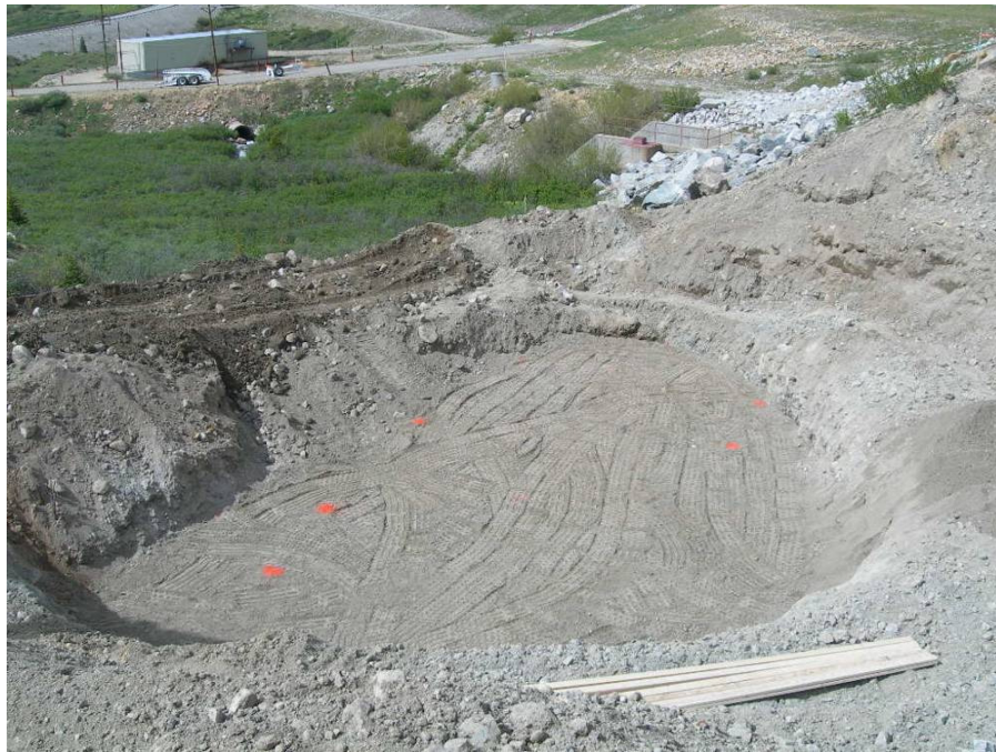
Figure 27. Compacted sub-grade for retaining wall of drop structure.

compacted with a mechanical sheep's foot and tested with a nuclear gauge to measure proctor densities. All measured densities were recorded at or above 98%.