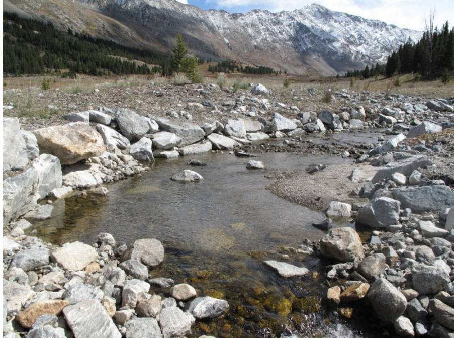
Figure 24. Point bar deposition at an inside meander.